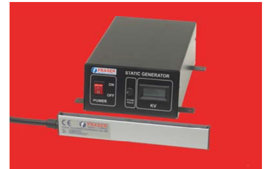
7080 Bar and 7300 Generator