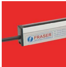
1250-Slot Bar for all of these applications