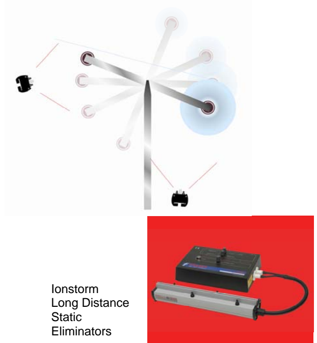
Ionstorm Long Distance Static Eliminators

On a turret rewind, position the Bar so that its ionisation will be attracted to both rewind positions, if this is not possible two bars may be needed.